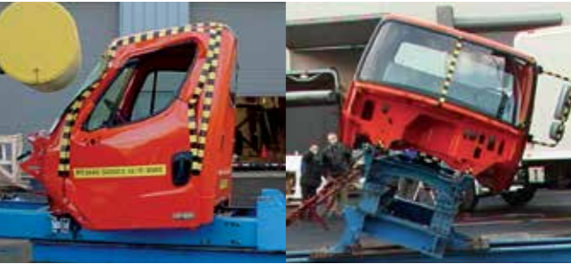
Components, systems and entire vehicles are subjected to an array of virtual and physical tests to ensure our trucks deliver the expected function, performance and reliability.